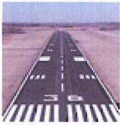
Runway 18/36 Extension